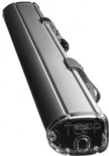
Электропривод цепной (C130 230В) в декоративном корпусе 1,2 м, ход цепи 360 мм, 230В Цена в руб. без рейтинга